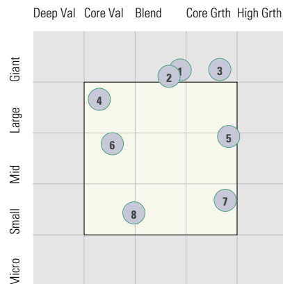
Morningstar Style Box US Stock