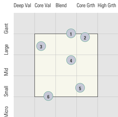
Morningstar Style Box US Stock